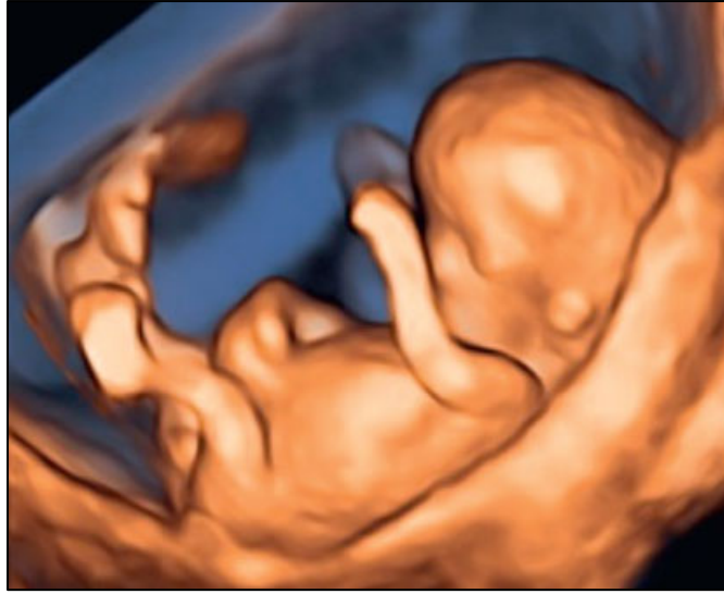
Unborn Child at Thirteen Weeks 39

At thirteen weeks, the bone structure is forming in the child's arms and legs, 40 and the intestines are in place within his or her abdomen. 41 At fourteen weeks, the roof of the child's mouth has formed, and his or her eyebrows begin to fill in. 42 By fifteen weeks, "the fetus is extremely sensitive to painful stimuli," and physicians (other than those performing abortions) take this fact "into account when performing invasive medical procedures on the fetus." 43 Even more neural circuitry for pain detection and transmission develops